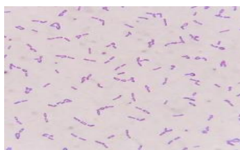
Fig 1: Microscopic view of Lactobacillus sp.

The non motile behaviour is a characteristic of L.acidophilus . Therefore the curd sample `bacterium resembles characters similar to Lactobacillus acidophilus . The catalase test is one of the most useful diagnostic tests for the recognition of bacteria due to their simplicity. In performing catalase test, no bubble was observed indicating that the isolated bacterium is catalase negative and could not mediate the decomposition of H 2 O 2 to produce O 2 . It is well known that Lactobacillus is catalase negative. Thus, the results obtained coincided with L. acidophilus strain characteristics. Their distinguishing features are shown in (Table 1 and Figure 1). Their biochemical characters are also shown in the (Table 2).