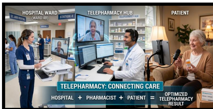
Figure 1: Communication between patient and Practitioner/Pharmacist.

Telepharmacy is the movement of medication care through media correspondences to patients where they probably won't have direct contact with a medical practitioner. It is an event within the broader scope of telemedicine, as practiced in the specialized field of pharmacy.