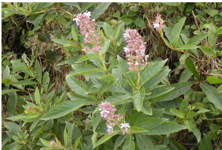
Figure 3: Leaf Morphology of Clerodendrum serratum (L.) Moon(63).