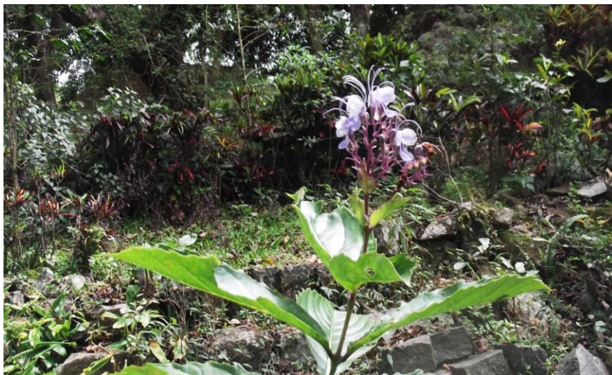
Figure 2: Floral Morphology of Clerodendrum serratum (L.) Moon (62).