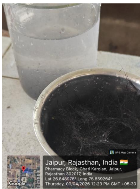
Figure No. 2: Keratin extraction from human hair.