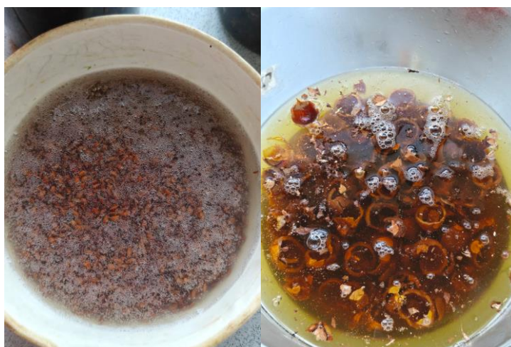
Figure No. 5: Extraction procedure of herbal drugs.