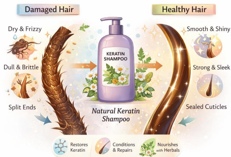
Figure No. 1: Comparison by healthy and damaged hair.