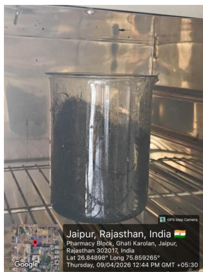
Figure No. 3: Heating of human hair.

The solution was filtered to remove residues. Keratin was precipitated by adjusting pH to 4–5 using acetic acid, followed by washing and drying to obtain keratin powder.