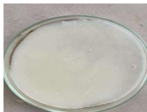
Figure No. 2: Shatdhauta Ghrita-Based Herbal Cream

Apply the Cream: - Dab a small amount of the cream (about the size of a pea) on the wrist area.