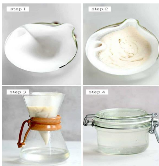
Figure 1: Extraction Of Cold Pressed Coconut Oil.

In order to remove extra water from the cream and separate the curd from the oil, fermentation was used. The coconut cream should be poured into a glass air tight jar, covered, and kept in a warm place for 8hrs. After that placed the glass jar with coconut cream in refrigerator for 8hrs. Removed the supernatant cream very carefully and transferred to an air tight glass jar and again fermented for 8hrs by placing the jar in tightly wrapped cloth bag. Curd and oil will eventually separate if you wrap it in a towel and keep it at 35 to 40 degrees Celsius, which will aid in fermenting the coconut cream and cause the oil to separate. The coconut curd will be at the bottom and the oil will be on top. Preserved the oil after filtering it through a nut milk bag.